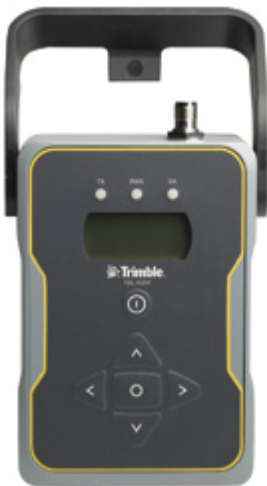
Trimble TDL 450H Radio

Designed to support all aspects of GNSS surveying, the Trimble® TDL 450 series offers flexible configuration options and rugged reliability. This sophisticated radio modem places Trimble's newest low power data link technology in your hands. For surveyors that need to make the most of every day, the Trimble TDL 450 series is a giant step forward in radio technology.