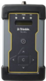
Trimble TDL 450L Radio

Super-rugged housing for robust reliability